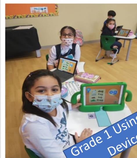
Grade 1 Using their Devices