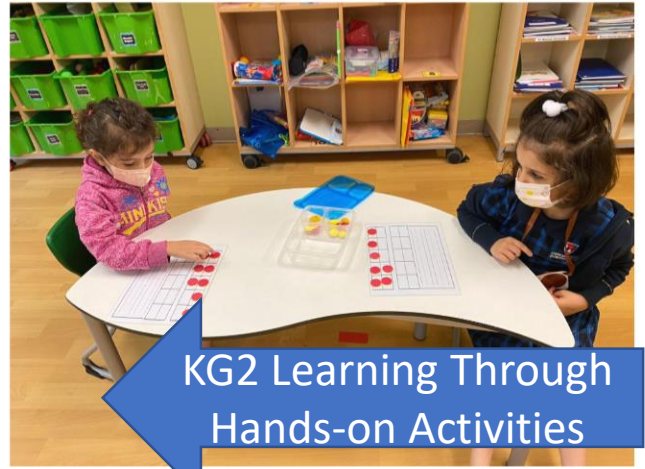
KG2 Learning Through Hands-on Activities